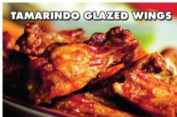
TAMARINDO GLAZED WINGS