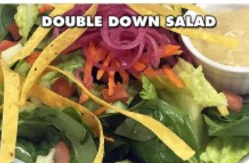
DOUBLE DOWN SALAD

Your choice of Chicken or Beef Mini-burgers with your choice of our favourite Cheeses: Mozzarella, Gouda, Swiss, Provolone